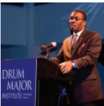
Buffalo Mayor Byron Brown, 2008 Annual Benefit

DMI continued to inform the debate on immigration policy. In 2006, before the issue catapulted to the forefront of the national conversation, DMI crafted a fresh framework for understanding how progressive immigration policy is in the best interest of the current and aspiring middle class in America. This year we shared our framework widely: through Spanish-language op-eds in El Diario ; on discussions about how immigration policy figured in the presidential race; in a DMI immigration briefing book that was distributed to members of Congress and staffers; in the blogosphere, including a series on the DMIBlog dedicated to immigration issues; and on TheMiddleClass.org where we provided analysis on key immigration legislation like the DREAM Act. We also embarked on an exciting partnership with Long Island Wins, a public information campaign to influence the conversation about immigration at ground zero of the debate.