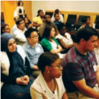
DMI Scholars, 2008 Summer Institute Opening Reception