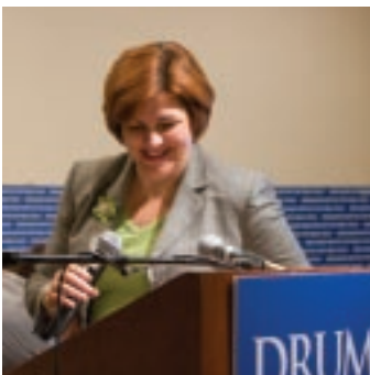
New York City Council Speaker, Christine Quinn